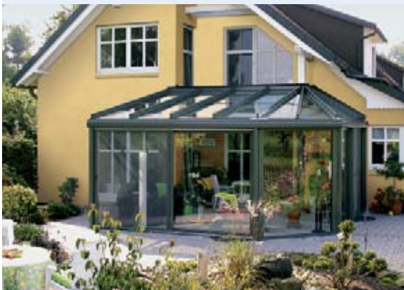
▲ weinor conservatories

No matter what you want to use your patio for, weinor has the right product for you – awnings, patio roofs and conservatories