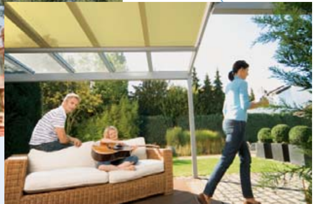
▲ weinor patio roofs