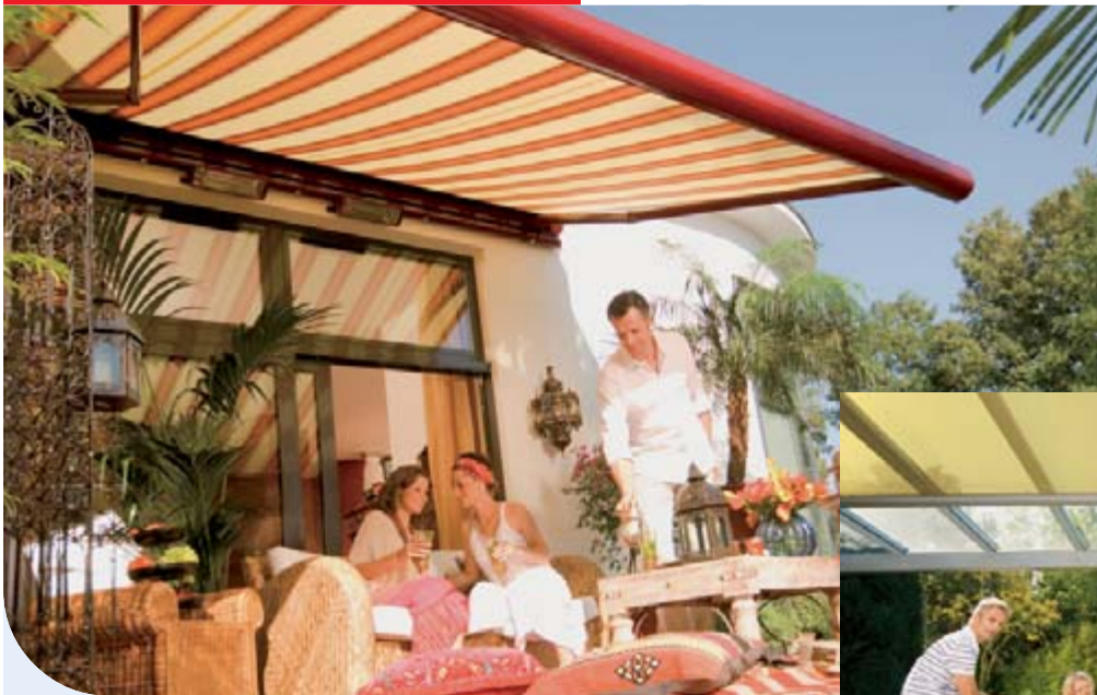
▲ weinor awnings