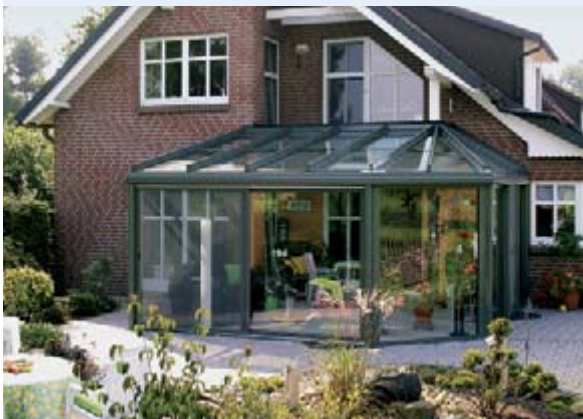
▲ weinor conservatories

No matter what you want to use your patio for, weinor has the right product for you – awnings, patio roofs and conservatories