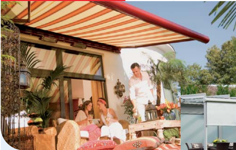
▲ weinor awnings